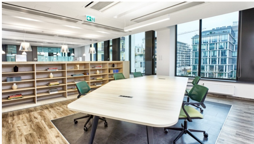
RP-CRO Headquarters, Hungary

A. One of the largest clinical research markets in Europe is Germany. They have a population of about 83 million people and some large population centres with dense subject pools. When you think about the five countries we operate in, they have a total population of 84 million. Our countries are each smaller but logistically our neighbors are just as close by and as EU member states we don't have to worry about international custom issues, so the net effect is that our collective market is similar in size to established leaders like Germany. Although each Central and Eastern European country has its own unique history, there are some commonalities that seem to help us to work together easily. We think we have a strong base of clinical research capabilities here and our costs can be an advantage for our customers.